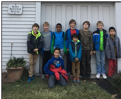
Hollis Cub Scout Pack 12 Bear Den